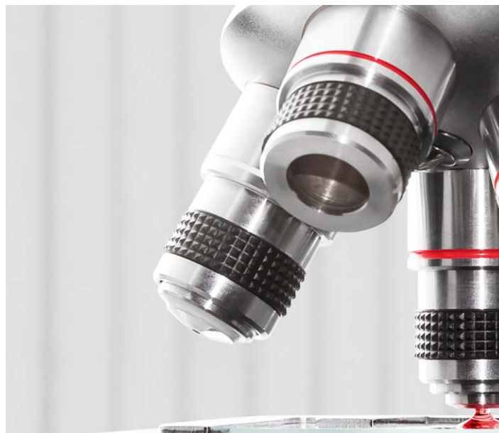
Scientific and Analytical Applications